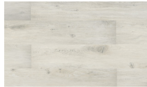
KLARA • 1526