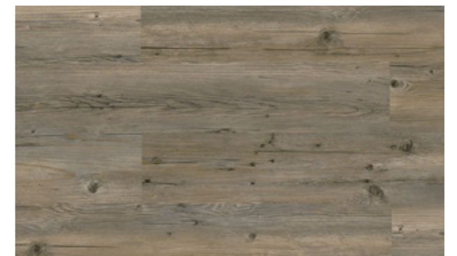
REFLEKTO • 4210