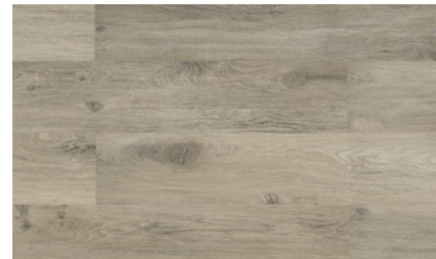
GITARO • 1527