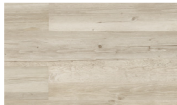
SONGO • 1407