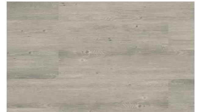
AERO • 4213