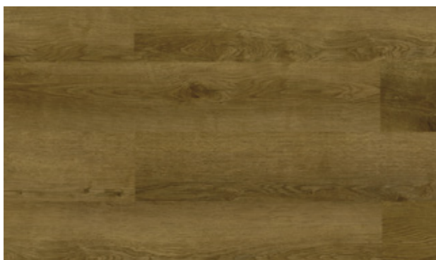
AKRA • 1406