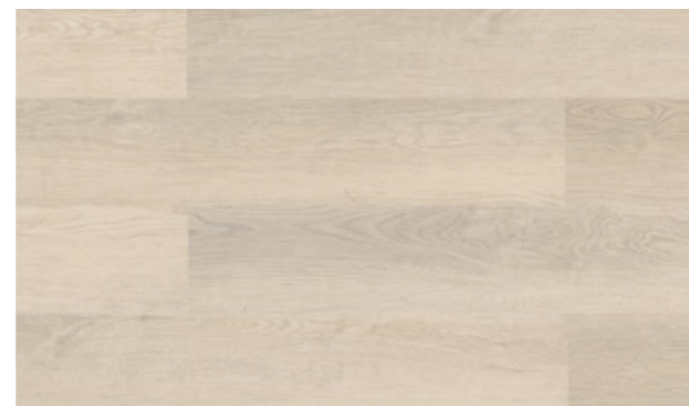
ALLOGA • 1401