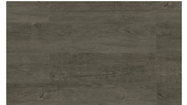
ARBARO • 4212