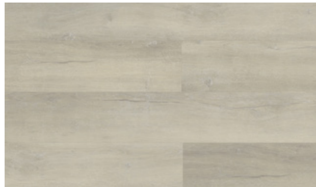
SPERTA • 1302