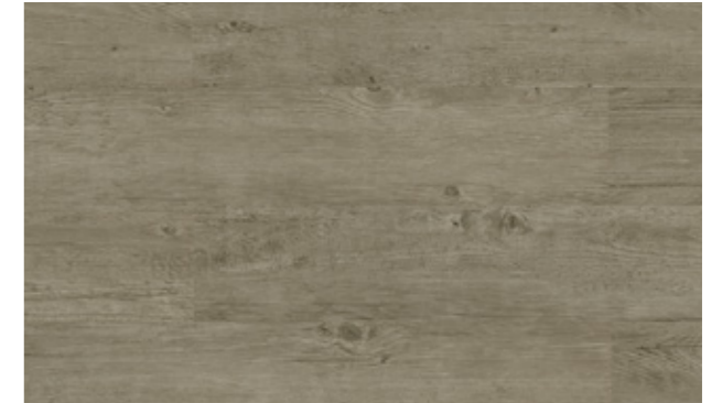
NATURA • 4211