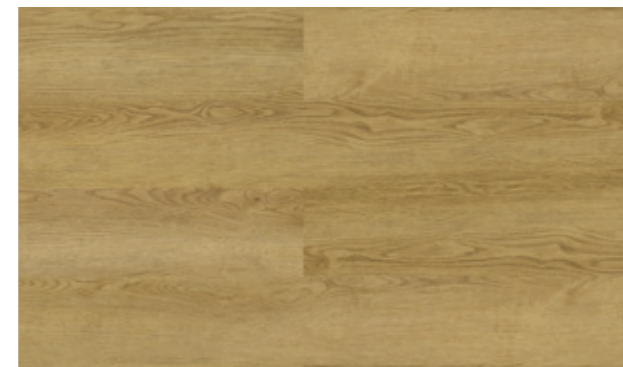
PLATANO • 1405