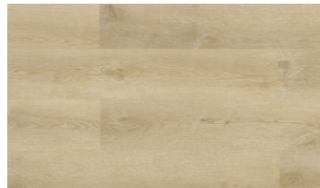
GRUNDO • 1402