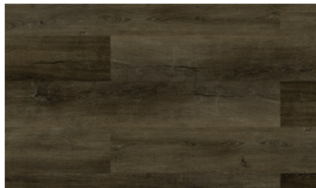
RAPIDA • 1306