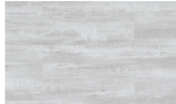
APERTA • 2010