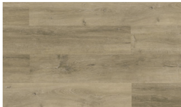
BONEGA • 1304